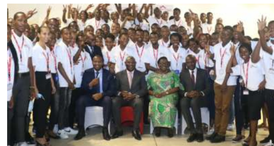
ELP Scholars from DRC.

Two scholars from the Democratic Republic of Congo (DRC), are part of the third Equity Leaders Program (ELP) cohort to receive support from EquityBCDC for further studies in prestigious universities abroad with full scholarships, supporting their development as future leaders. 403 scholars have so far benefitted from ELP since its inception in 2022.