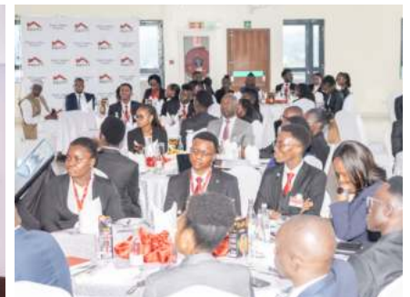
A section of ELP scholars follow proceedings during the commissioning of scholars who will be joining 71 global universities.