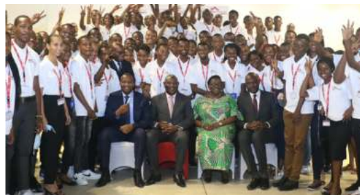
ELP Scholars from DRC.

Two scholars from the Democratic Republic of Congo (DRC), are part of the third Equity Leaders Program (ELP) cohort to receive support from EquityBCDC for further studies in prestigious universities abroad with full scholarships, supporting their development as future leaders. 403 scholars have so far benefitted from ELP since its inception in 2022.