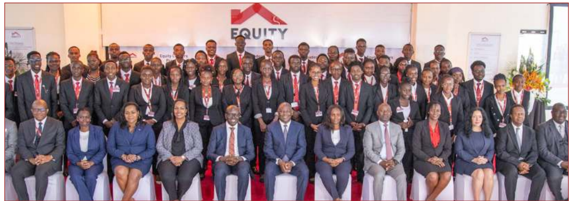
The Equity Group leadership led by Equity Group Foundation Executive Chairman, Dr. James Mwangi (centre) together with the Equity Leaders Program (ELP) scholars.

"As you embark on this journey, remember to stay adaptable and embrace every challenge with integrity. Embrace the journey ahead and be open to different cultures