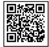
Scan QR code to watch 2024 Equity Leaders Program Airlift Commissioning

your experiences abroad broaden their horizons and also inspire those behind you to create lasting change. Remember, you carry the hopes and dreams of your family and country."