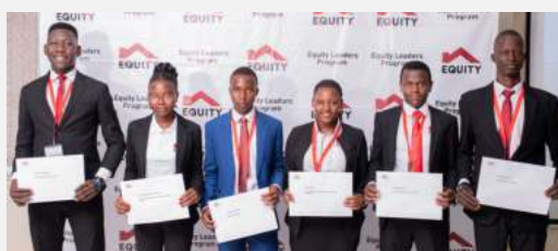
ELP Scholars from Uganda set to join global universities.