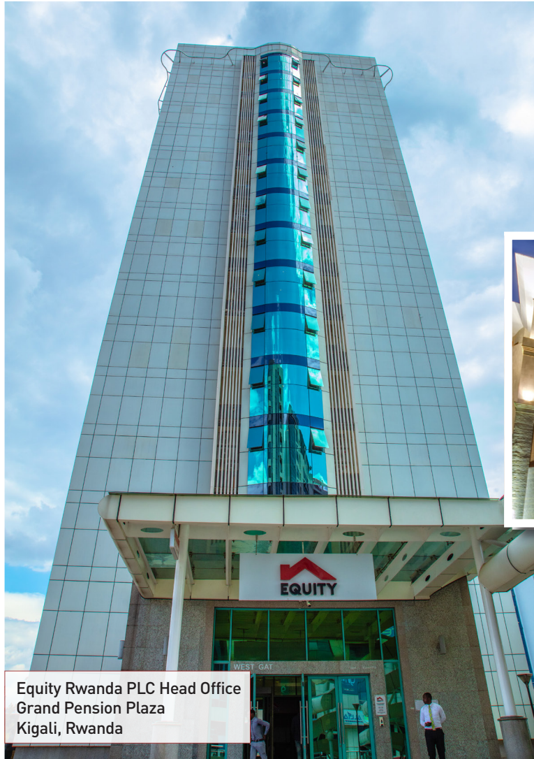
Equity Rwanda PLC Head Office Grand Pension Plaza Kigali, Rwanda