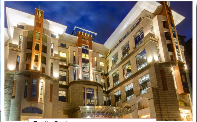
Equity Centre Equity Group Holdings PLC Head Office Nairobi, Kenya