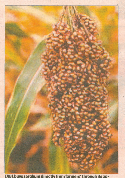
pointed purchasing agent. FILE

sorghum, a drought resistant variety, directly from farmers' through its appointed purchas-