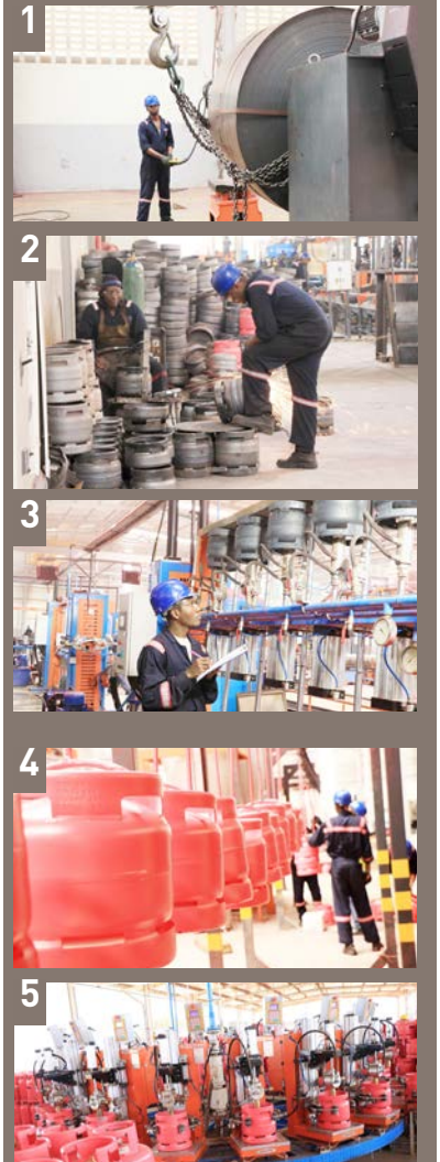
1. Assembly 2. Welding 3. Testing for leakage 4. Painting 5. Filling

Proto manufactures 5,000 cylinders per day at the factory situated at Kabati in Murang'a. It has loading arms for bulk supply to industrial customers including hospitals, schools, hotels and manufacturers.