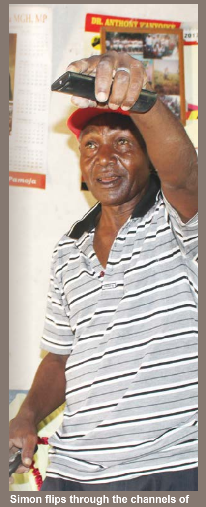
his television set.

has eliminated pollution from poorly calibrated homemade lanterns that spewed black smoke darkening the room walls over time. "La muhimu zaidi ni kwamba watoto wangu sasa hawasumbuliwi na moshi na maradhi inayosababishwa na moshi huo. Sasa inayosababishwa na moshi huo. Sasa nimejua inaweza kukupa uhuru wa kufurahia maisha. (Of importance is that my children do not suffer from smoke related ailments. I now know the sun can give you the freedom to enjoy life)."